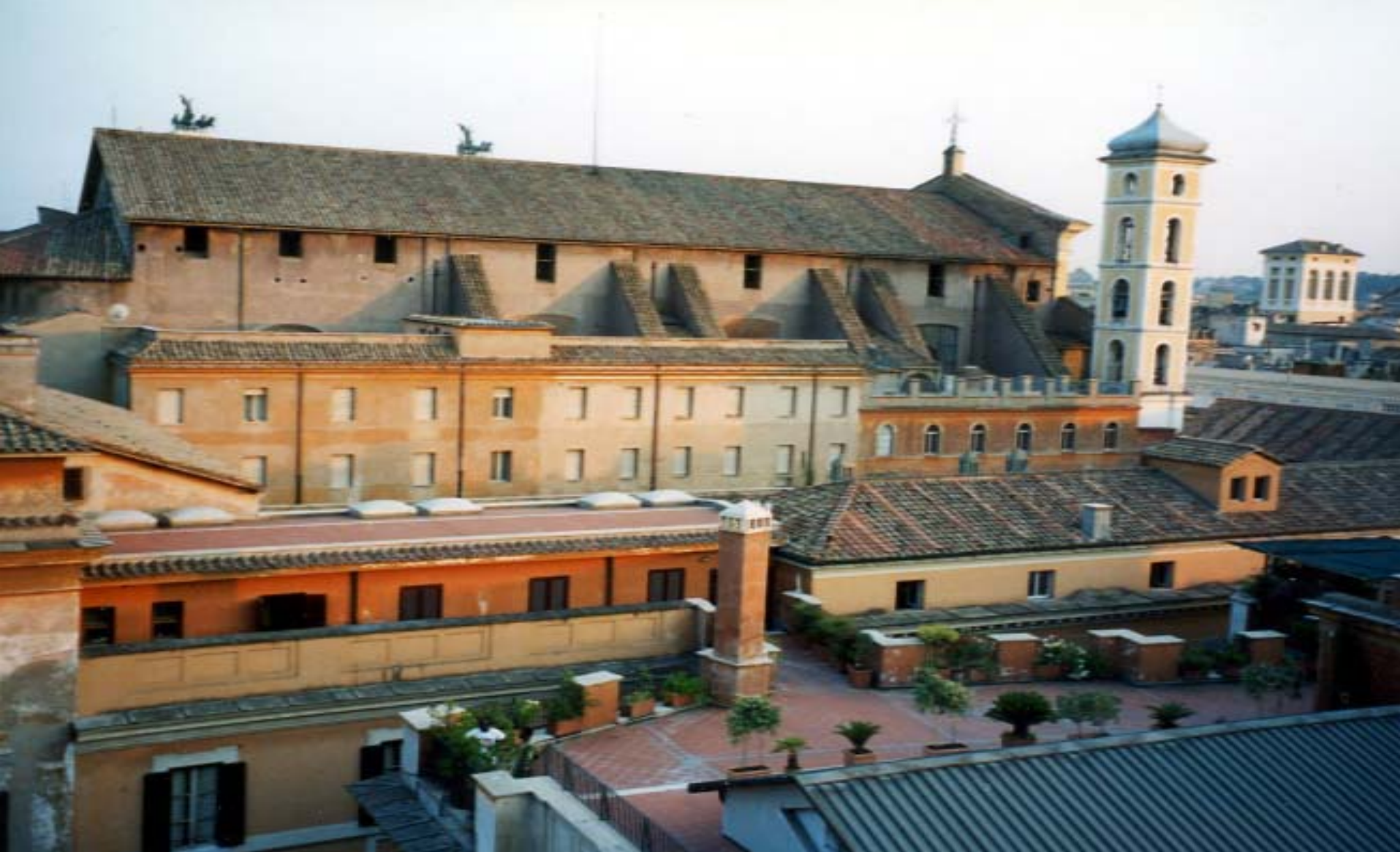
Chiesa de SS. Dodici Apostoli